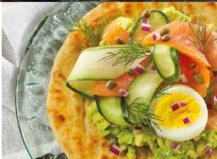
Greek Lifestyle Flatbread makes a good thing "better for you."