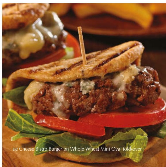
ue Cheese Bistro Burger on Whole Wheat Mini Oval fold-over