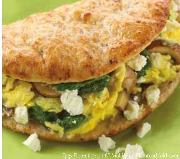
Eggs Florentine on 8" Multigrain Flatbread fold-over