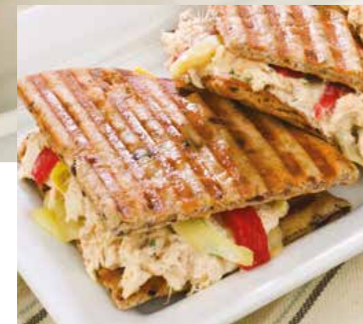
8" Panini Bread grilled on a panini press with tuna salad & roasted red peppers.