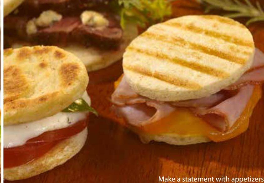
Make a statement with appetizers. Everything looks great on Cocktail Flatbread.