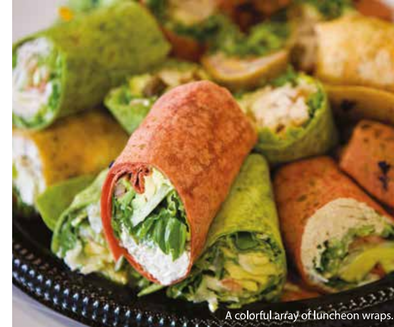
A colorful array of luncheon wraps.