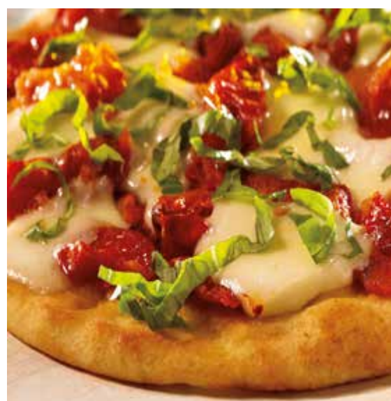
Kontos Pizza Parlor Crust topped with mozzarella cheese, sundried tomatoes and fresh basil.