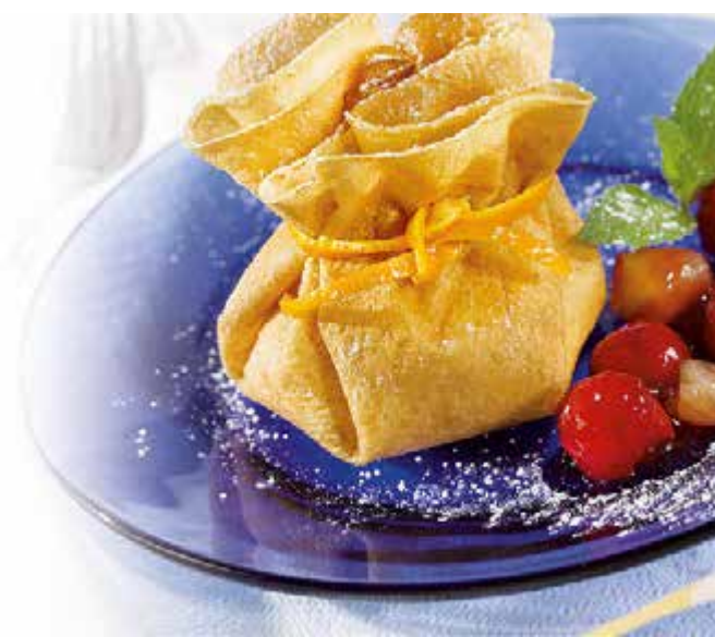
Fruit Compote in Beggars Pouch