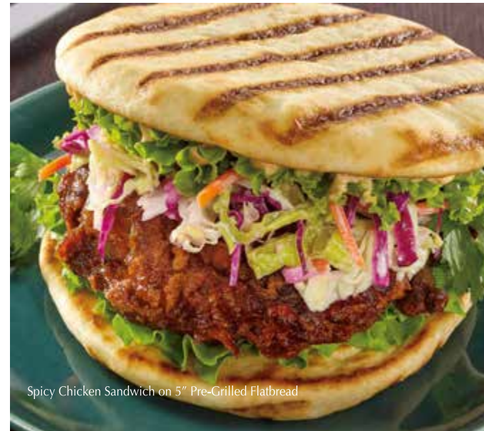
Spicy Chicken Sandwich on 5" Pre-Grilled Flatbread

Pre-Grilled varieties save you time and add great visual appeal to your menu offerings.