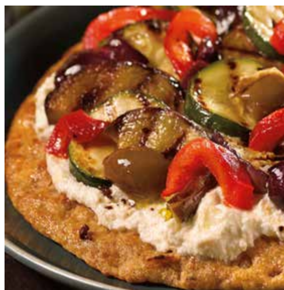
The nutty flavor of Multigrain Pizza Parlor Crust makes a luscious meal when topped with ricotta, roasted eggplant, peppers and zucchini.