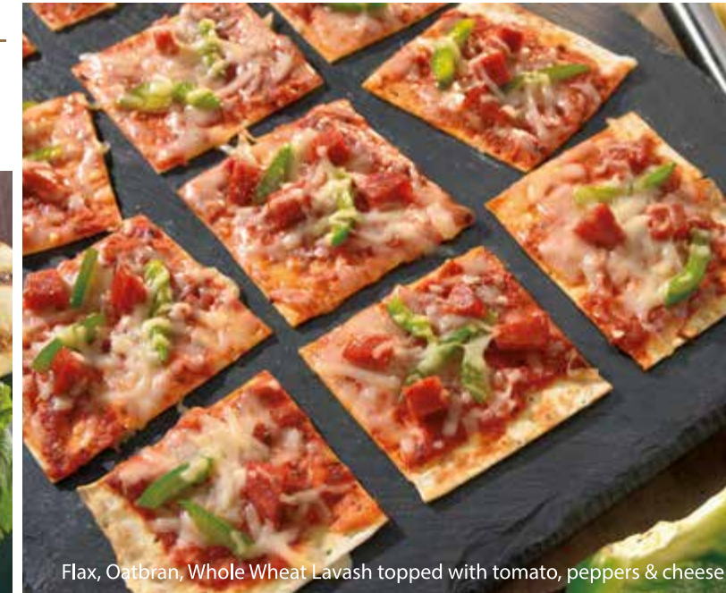
Flax, Oatbran, Whole Wheat Lavash topped with tomato, peppers & cheese