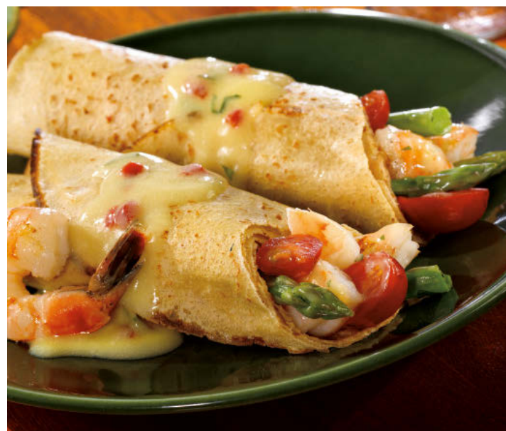
Shrimp & Asparagus rolled in a Savory Crepe