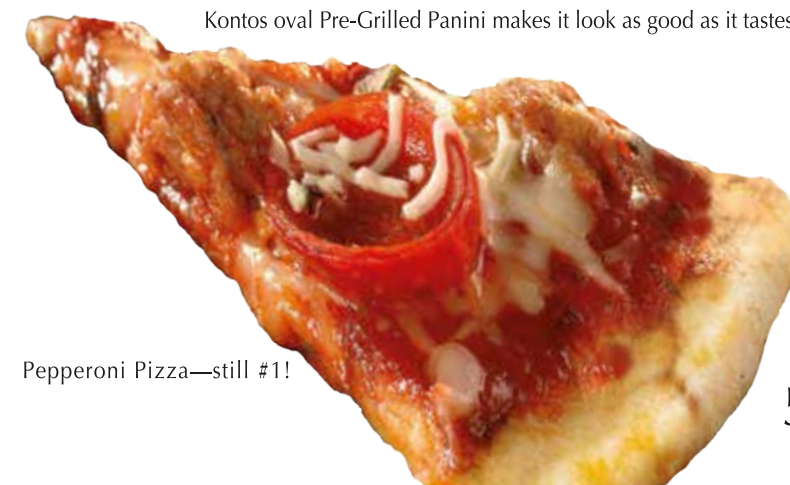
Pepperoni Pizza—still #1!