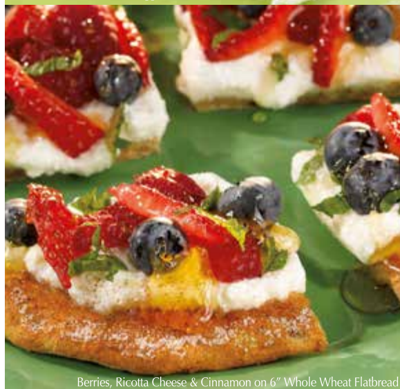
Berries, Ricotta Cheese & Cinnamon on 6" Whole Wheat Flatbread