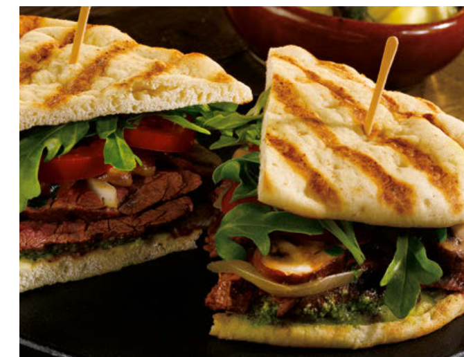
Grilled sliced steak never tasted better! Kontos oval Pre-Grilled Panini makes it look as good as it tastes.

Use our pre-grilled panini bread to add additional interest to a personal pizza.