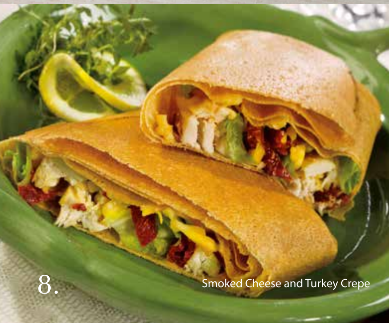
Smoked Cheese and Turkey Crepe