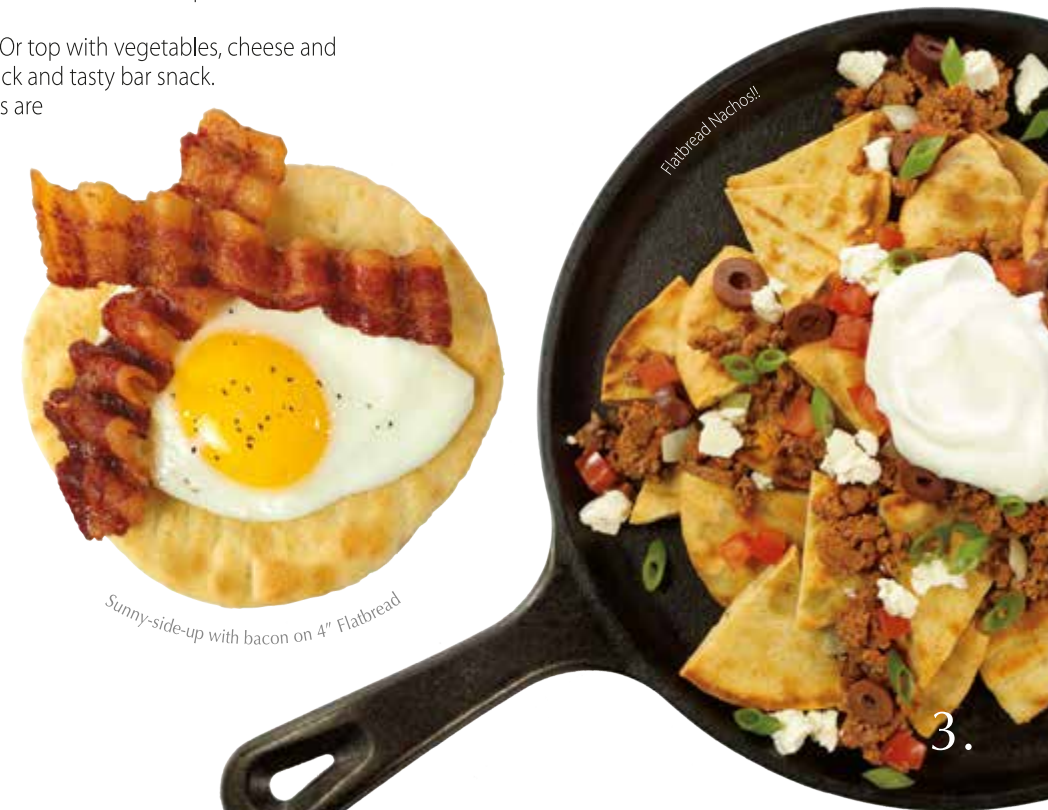
Sunny-side-up with bacon on 4" Flatbread

Our 6" to 9" Rounds or Ovals make a hearty cold sandwich. Or top with vegetables, cheese and chicken, then warm in the oven or on a grill for a quick and tasty bar snack. Make a skillet of flatbread Nachos when your patrons are looking for a late-night snack.