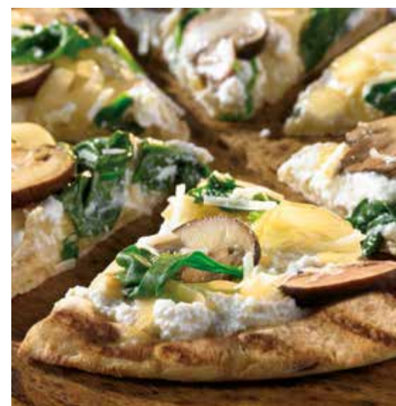
Healthy Whole Wheat Pre-Grilled Panini makes a great crust for a pizza, combined with Portabella mushrooms, spinach and a soft cheese.