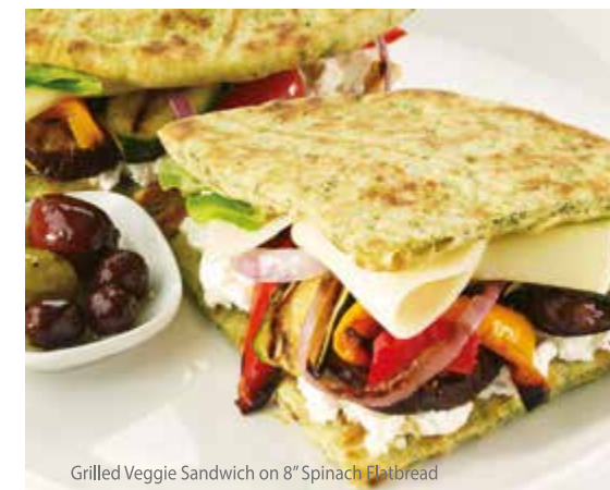
Grilled Veggie Sandwich on 8" Spinach Flatbread