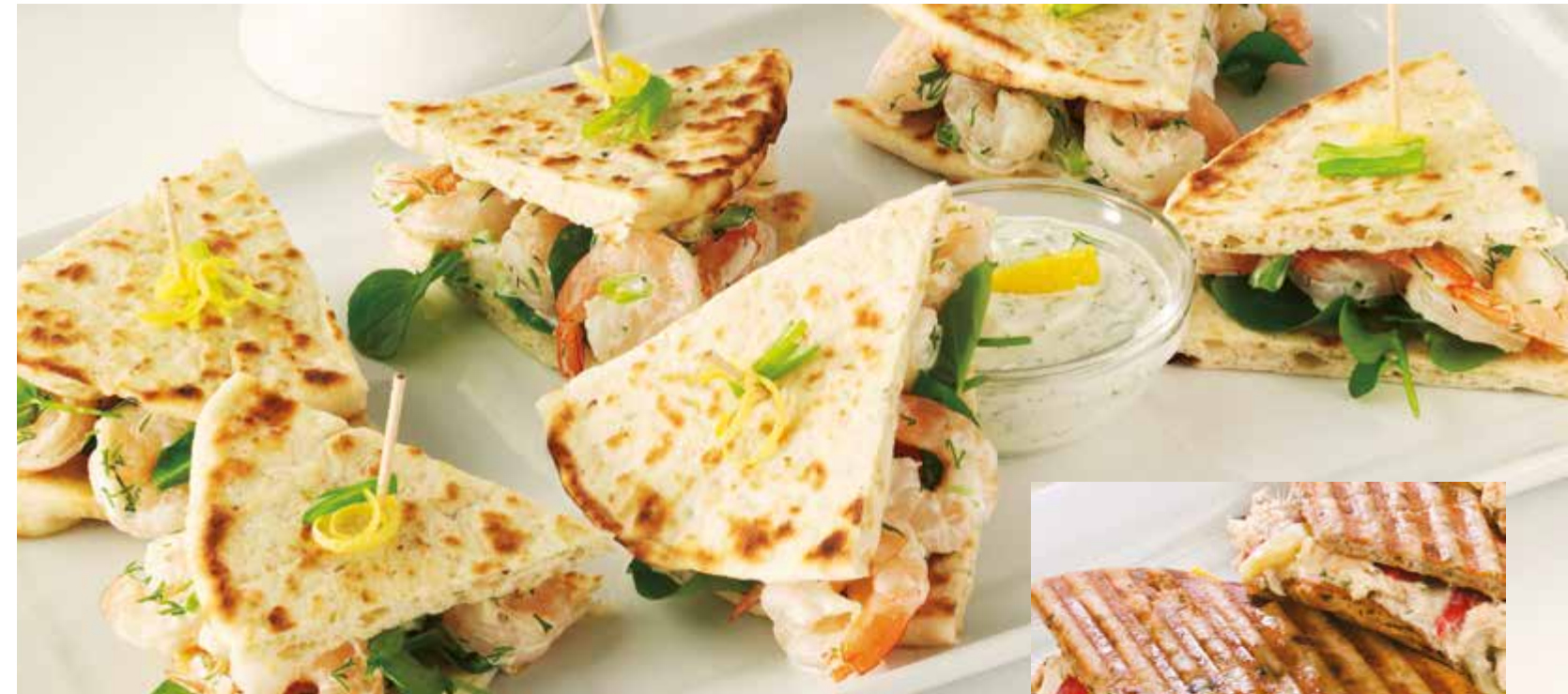
Shrimp salad with a dilly lemon sauce on toasted 8" Panini makes a beautiful summer lunch for guests.